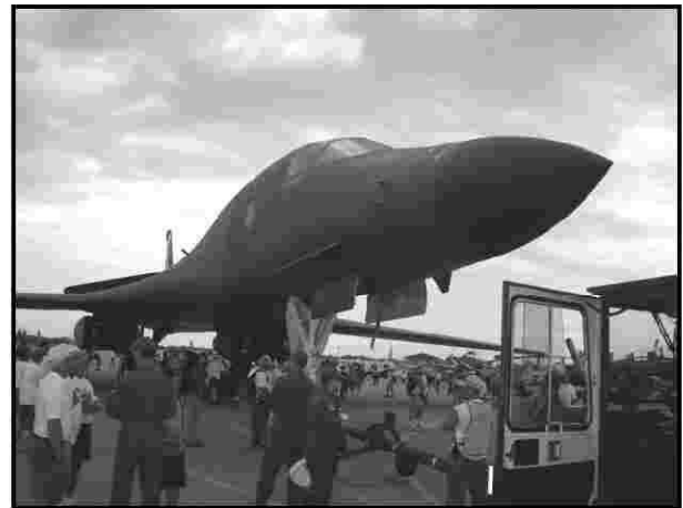
B-1B on AeroShell Square

Because of the "Mom" situation, I cut my convention stay short by a day and flew home Friday morning, and then returned with my truck to retrieve the camping gear, to spend the rest of the day with her.