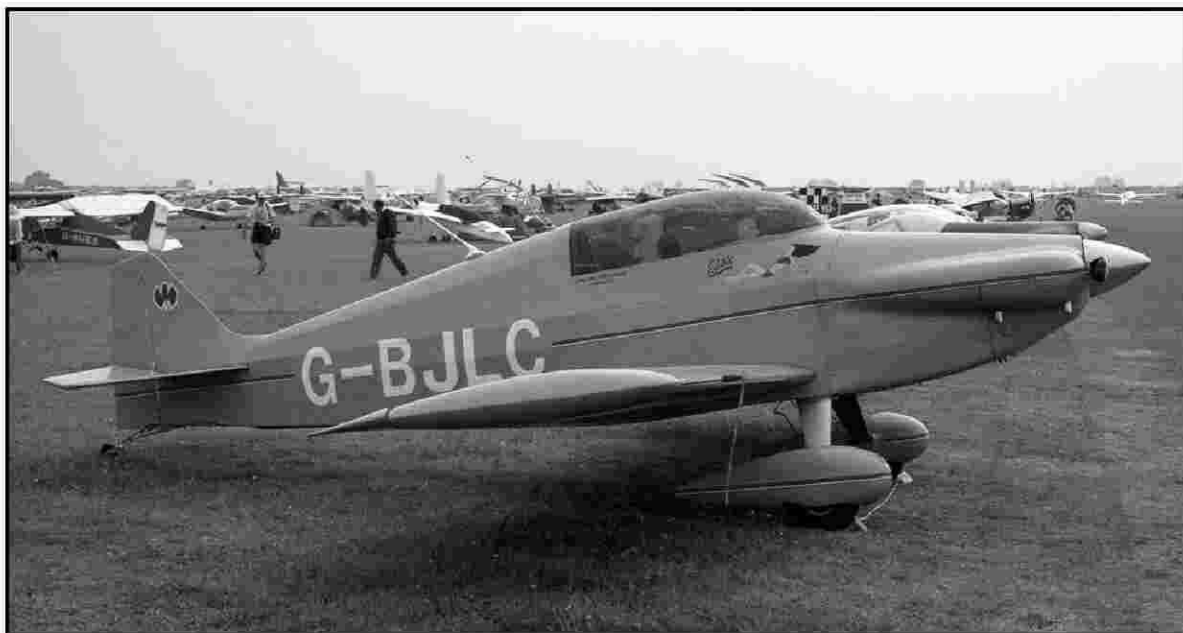
Pete Yeo's Sonerai IIL

FOR SALE: Sonerai I project. Approx 80% finished overall, have most parts to finish except cover. For more info write to this address: Dan Maiott, 13152 Washburn Rd., Otterlake, MI 48464 with mailing address and phone. Would consider trade for Mini-Max project. Approx value $3700 - $4000 (4/06)