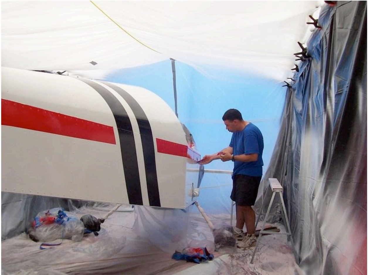
With the final coat of paint applied, the masking is removed