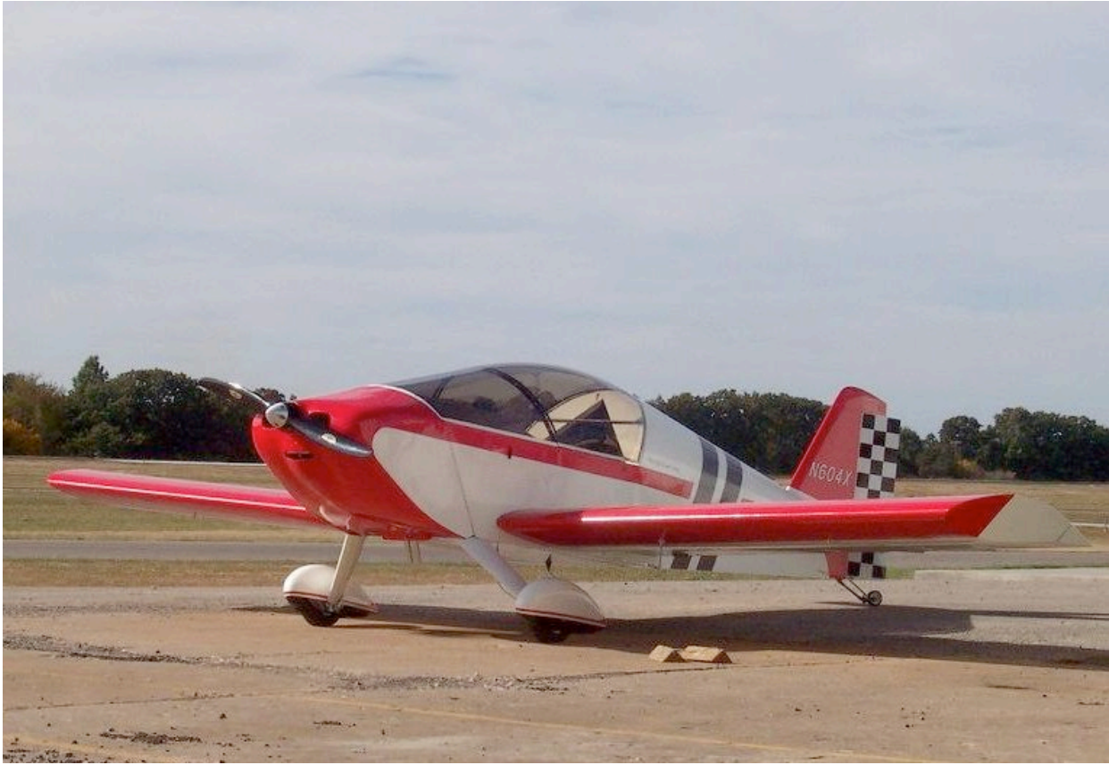
Airworthiness Inspection now complete, and Sonex N604X is ready to take flight