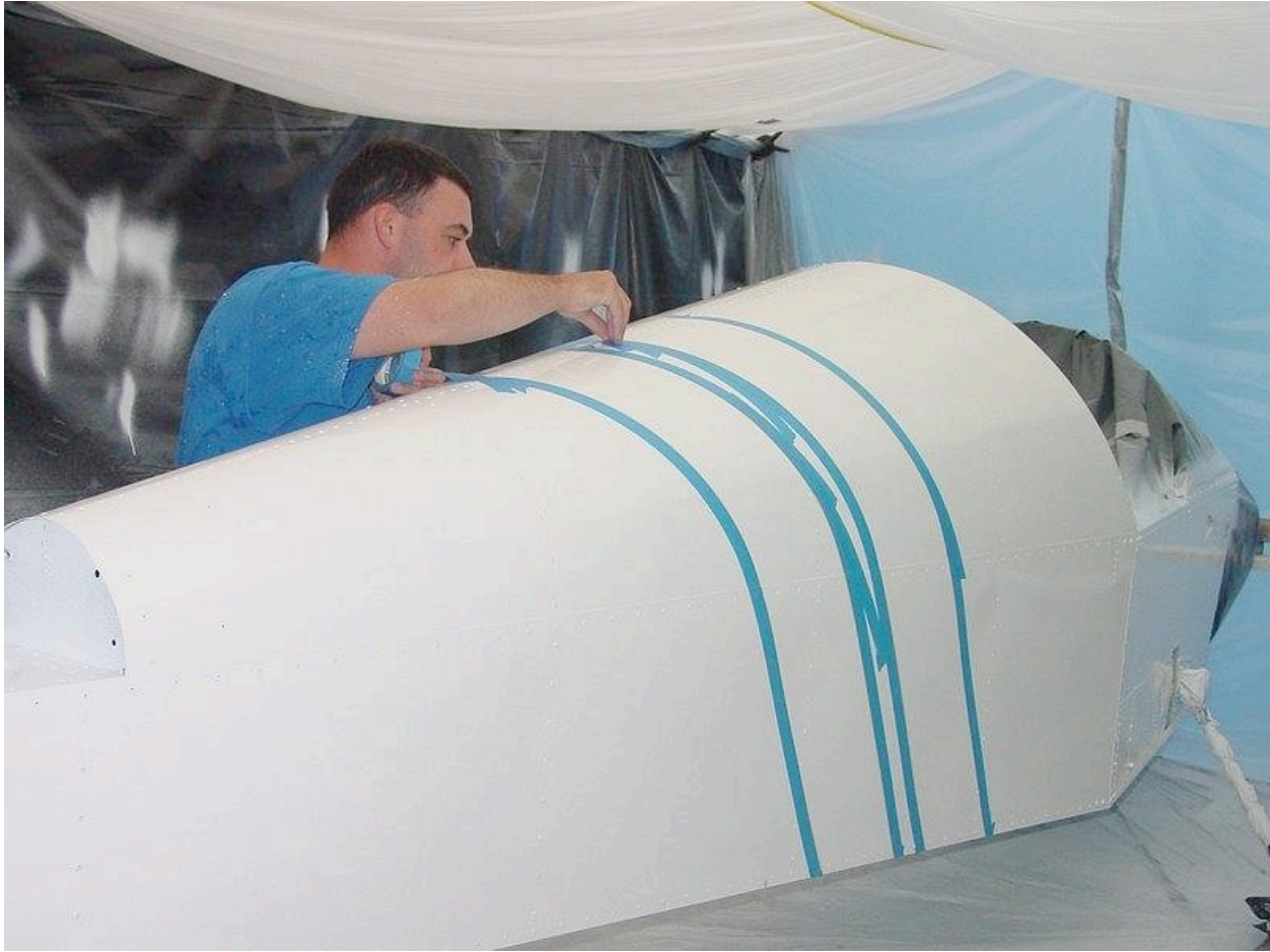
Fuselage stripes are laid out and taped in preparation for the next color coat