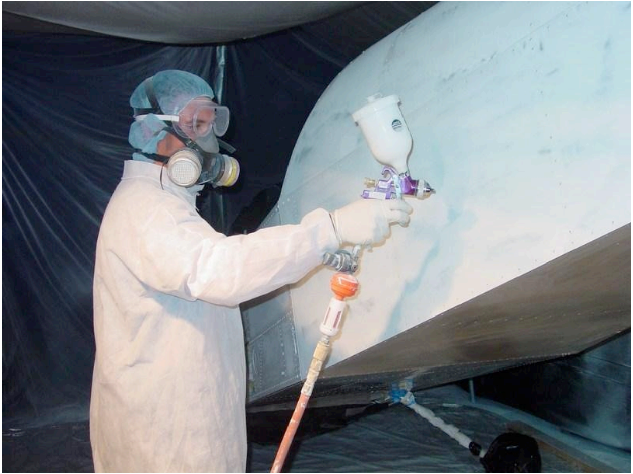
The fuselage was painted in a temporary paint booth set up in the driveway. Here, the fuselage is receiving a coat of primer.