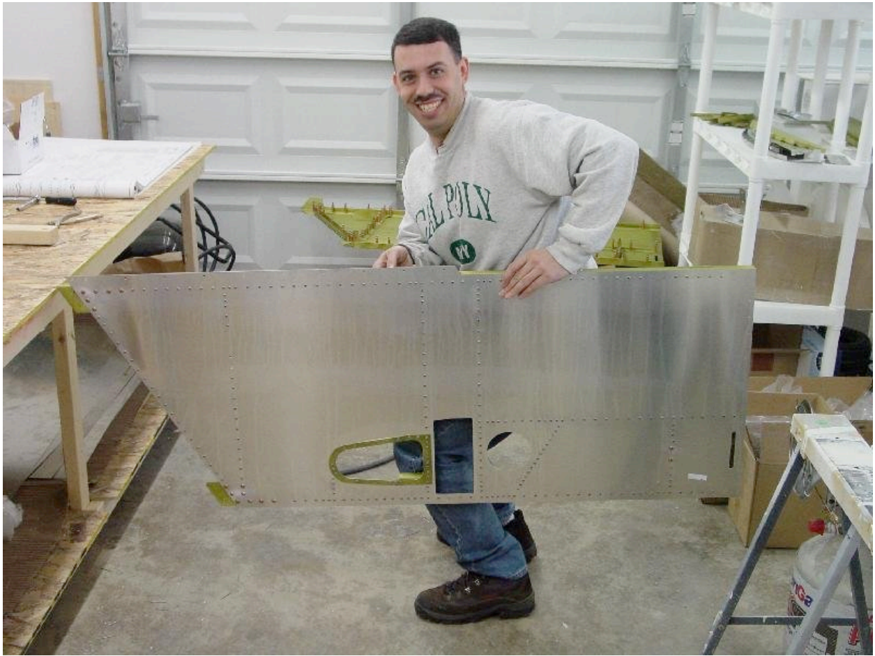
Trying on for size the first completed section of the fuselage