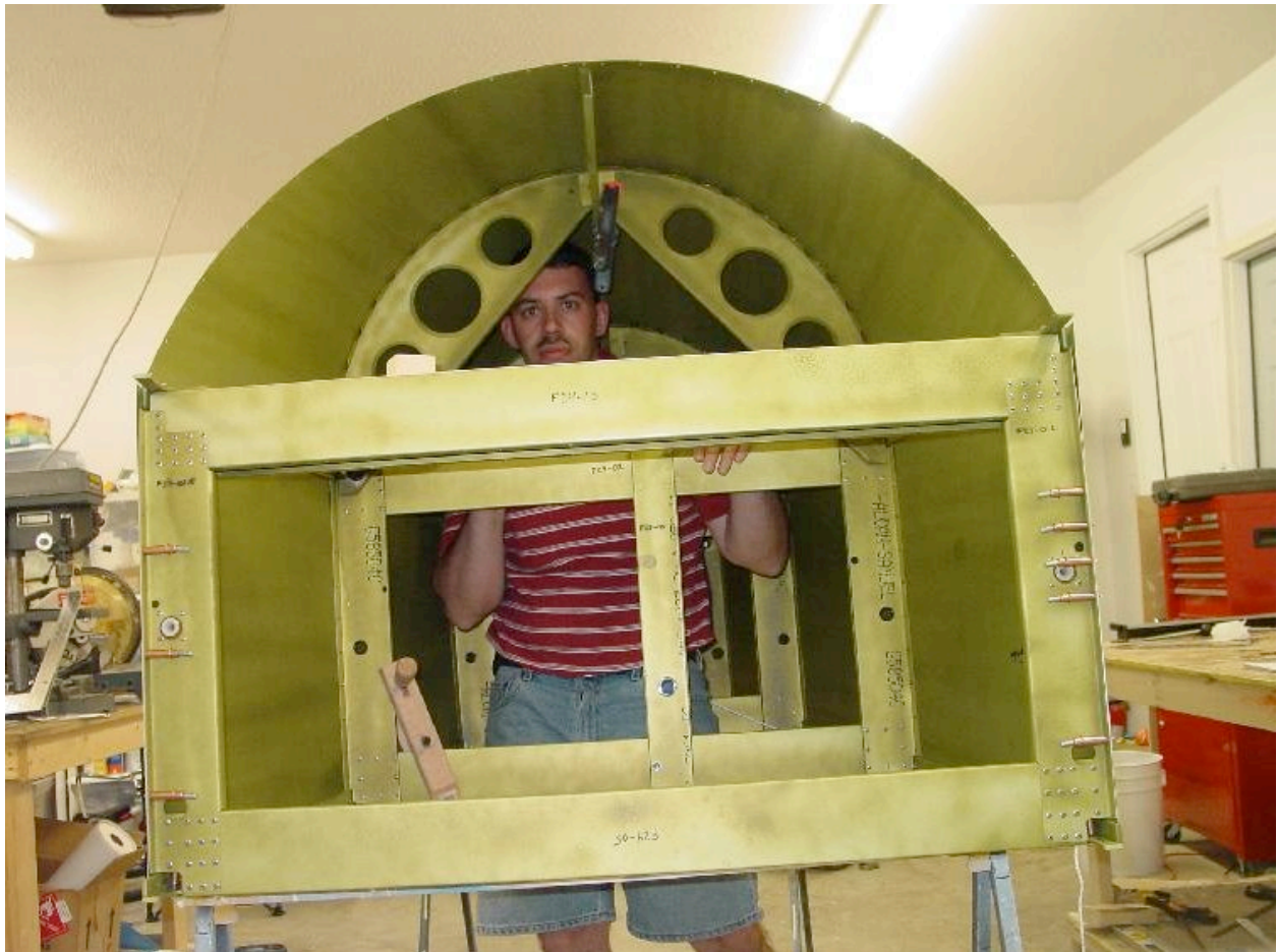
Fitting the turtledeck formers into the aft fuselage