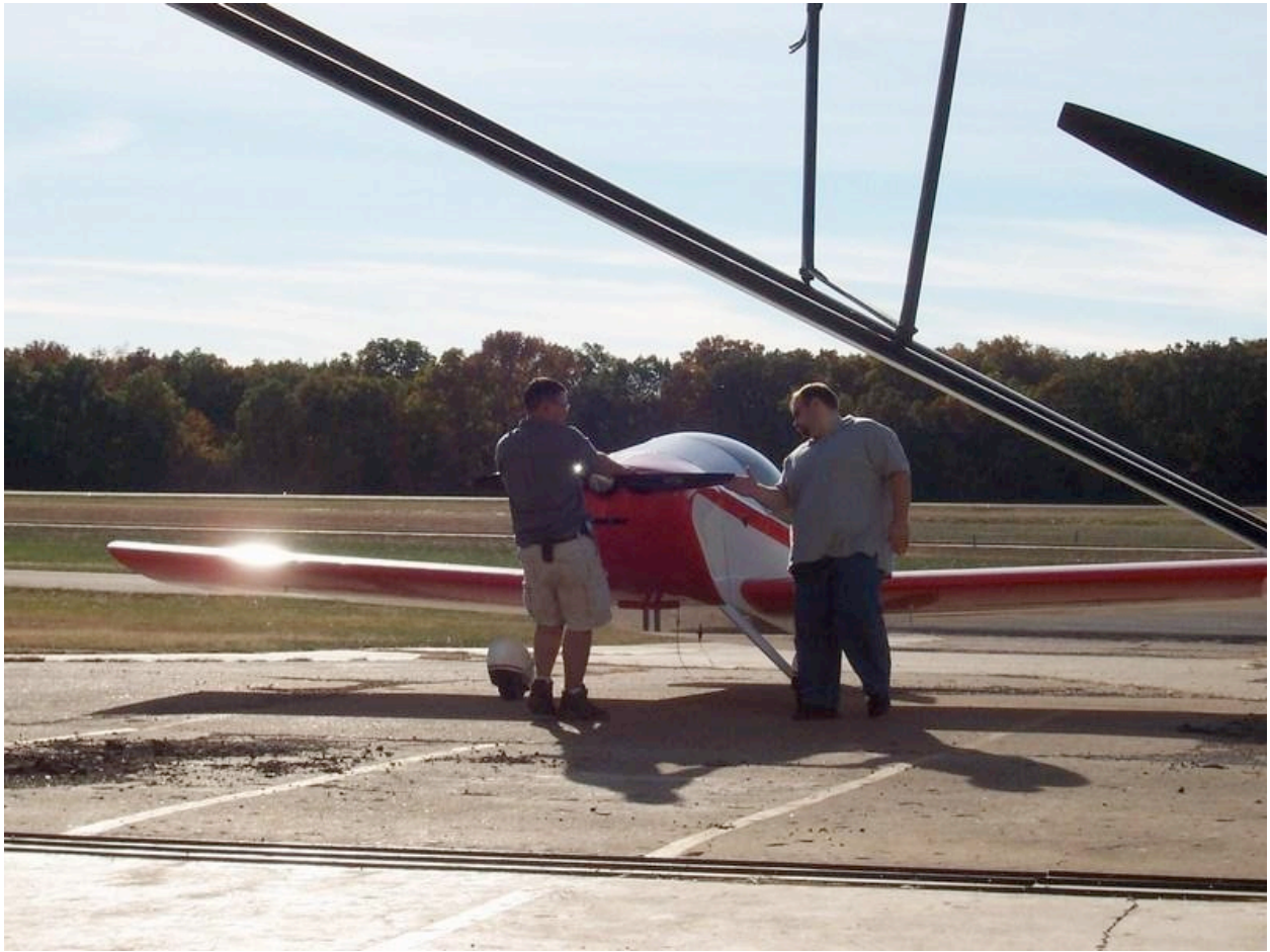
Putting the plane away in the hanger after another successful flight