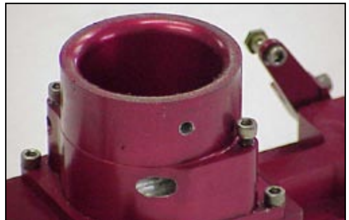
Figure 1.2 The intake bell drilled and tapped for the AN3-11A bolt provided with the air filter.