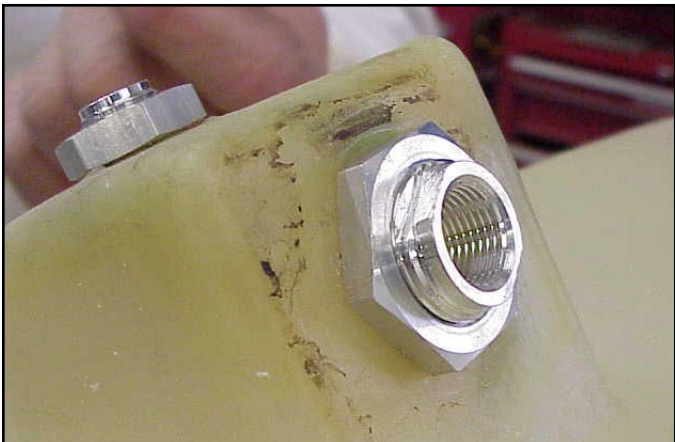
The Oops fitting installed.